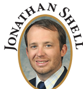
JONATHAN SHELL MAJORITY FLOOR LEADER