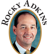
ROCKY ADKINS MINORITY FLOOR LEADER